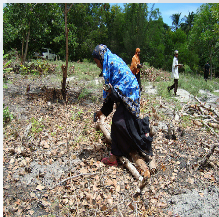
COMMUNITY TREE PLANTING.

(e.g. it may not be possible for the income from REDD+ to compete with income from biofuels);