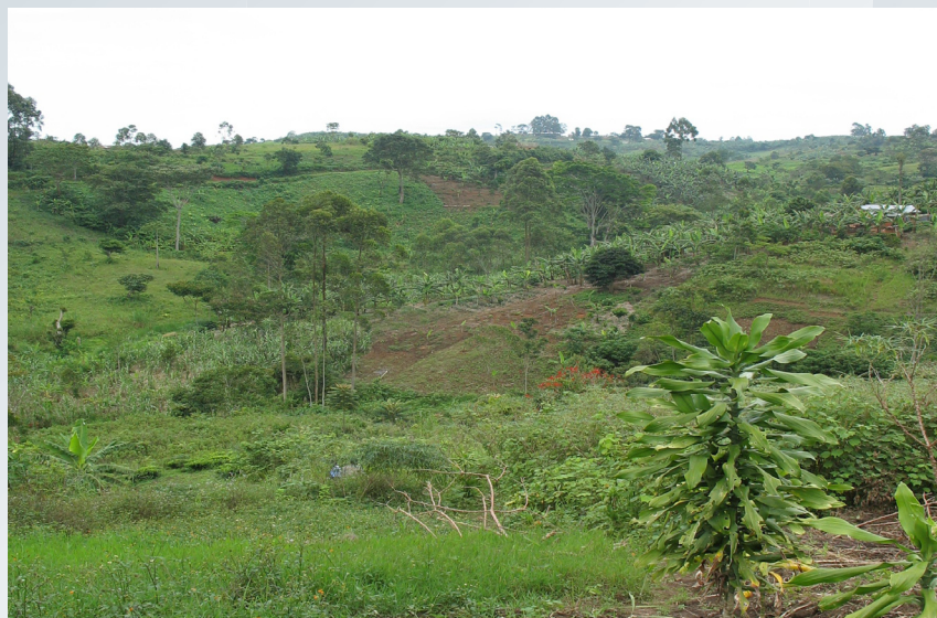
LANDSCAPE IN SW UGANDA WHERE EXISTING CARBON PROJECTS ARE OPERATING

District Forest Officers have responsibility to manage District Forests but degradation rates are still high due to various factors. These include corruption, lack of political will and weak governance. Limited financing for programme implementation also means that it is difficult to effectively offer services for sustainable forestry management and enforce policies. Moreover, laws have achieved little in decreasing rates of deforestation and forest degradation which are often fuelled by the agricultural expansion such as through oil palm plantation development