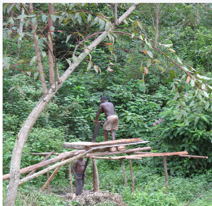
TIMBER PROCESSING IN UGANDA

The way in which benefits (and costs) are shared is likely to be a key factor in developing REDD+ systems that are sustainable in the long term. It is frequently argued that ensuring benefits reach those actors most affected by REDD+ policies, such as the forest dependent poor, is the only way to ensure that forests are effectively protected. Examples of the benefits associated with REDD+ could include direct payments for the carbon stored in trees, indirect income from employment, or non-monetary benefits such as infrastructure investments or improved local environmental quality. In this article, we take a brief look at the REDD+ process in Uganda and draw insights from existing systems of benefit sharing, in order to understand more about benefit sharing systems in REDD+.