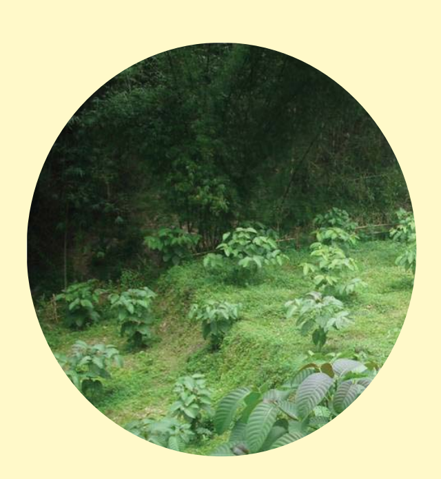
Table of Content of the FPIC Guidelines